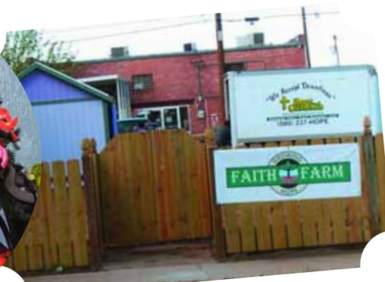
Faith Farm progress is marked by a new shed, parking space and newly installed irrigation plumbing.